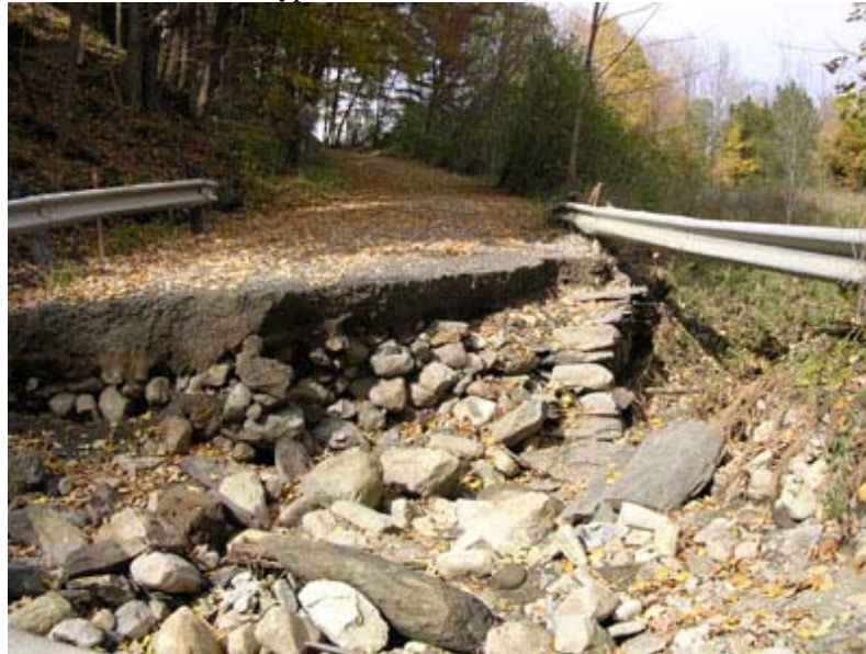
Figure 4. Bank Erosion and Road/Bridge washout. Photo taken April 20, 2007.

b) Flooding is also a major concern expressed by the public - Flooding occurs throughout the Ten Mile River Basin and causes significant damages in populated areas and appears to be worsened by the reduced channel capacity discussed above. The primary commercial and residential areas damaged by flooding are in the Hamlet of Wassaic and Dover Plains. The situation would likely worsen in without project future conditions.