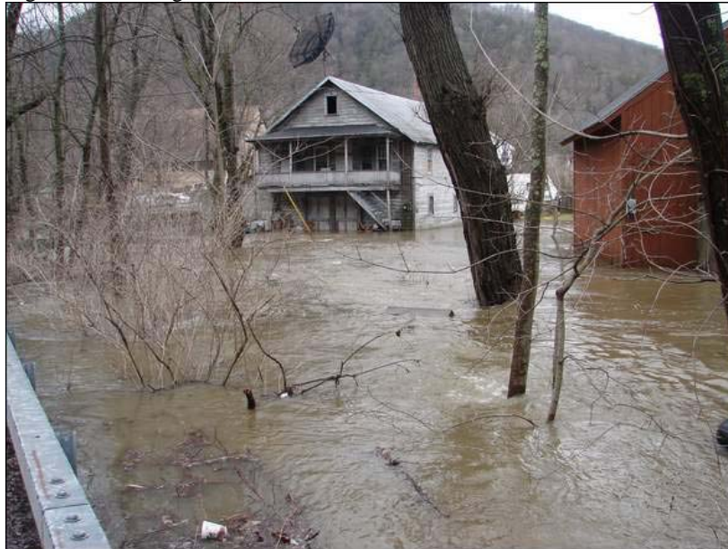
Figure 6. Flooding in Wassaic, NY during the April 2007 nor'easter.