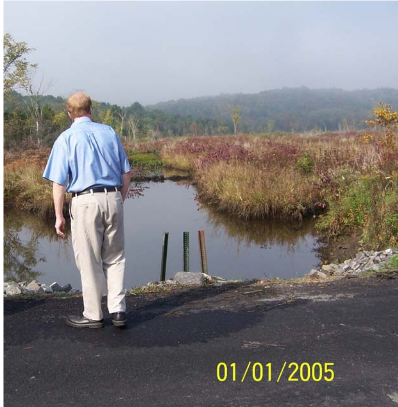
Figure 8. Perpetually flooded wetland complex in the Town of Northeast – prime Bog Turtle habitat. Photo taken October 5, 2007.

2. Opportunities. Opportunities exist throughout the Ten Mile River Watershed study area to address the problems of fluvial flood damages, streambank erosion, sediment aggradation, and ecosystem degradation. Local interests have expressed the urgency of working together to find long-term comprehensive solutions.