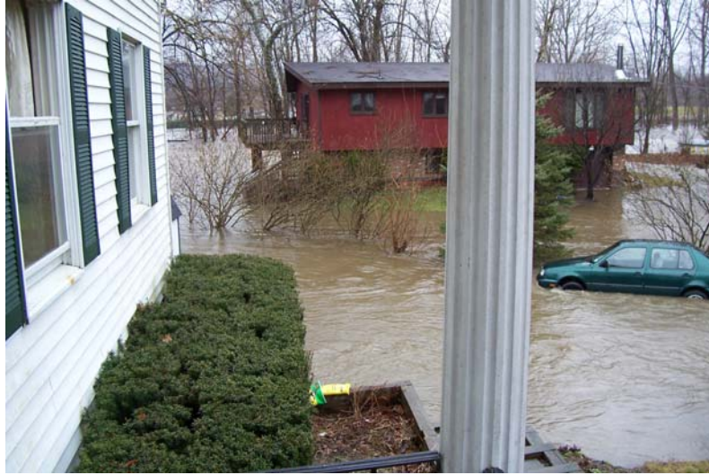
Figure 5. Flooding in Dover Plains, NY from the Ten Mile River. Photo Taken April 16, 2007.