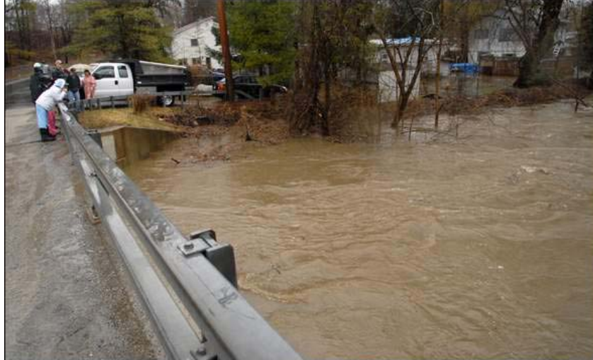
Figure 7. Flooding in Dover Plains, NY during the April 2007 nor'easter.

c) Obstructions of the channel are found throughout the Ten Mile River Basin. These obstructions are typically in the form of debris jams, large trees, and culverts and can cause a “damming” effect upstream of the obstruction.