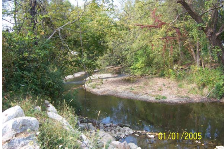
Figure 3. Accretion of sediment – typical of the Ten Mile River Watershed. Photo taken October 5, 2007